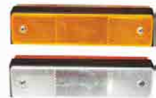
Rectangle guardrail reflector Size: L180 x W45 x H50mm Double sides reflectors

Size: L120xW50xH70mm Double sides with double supports