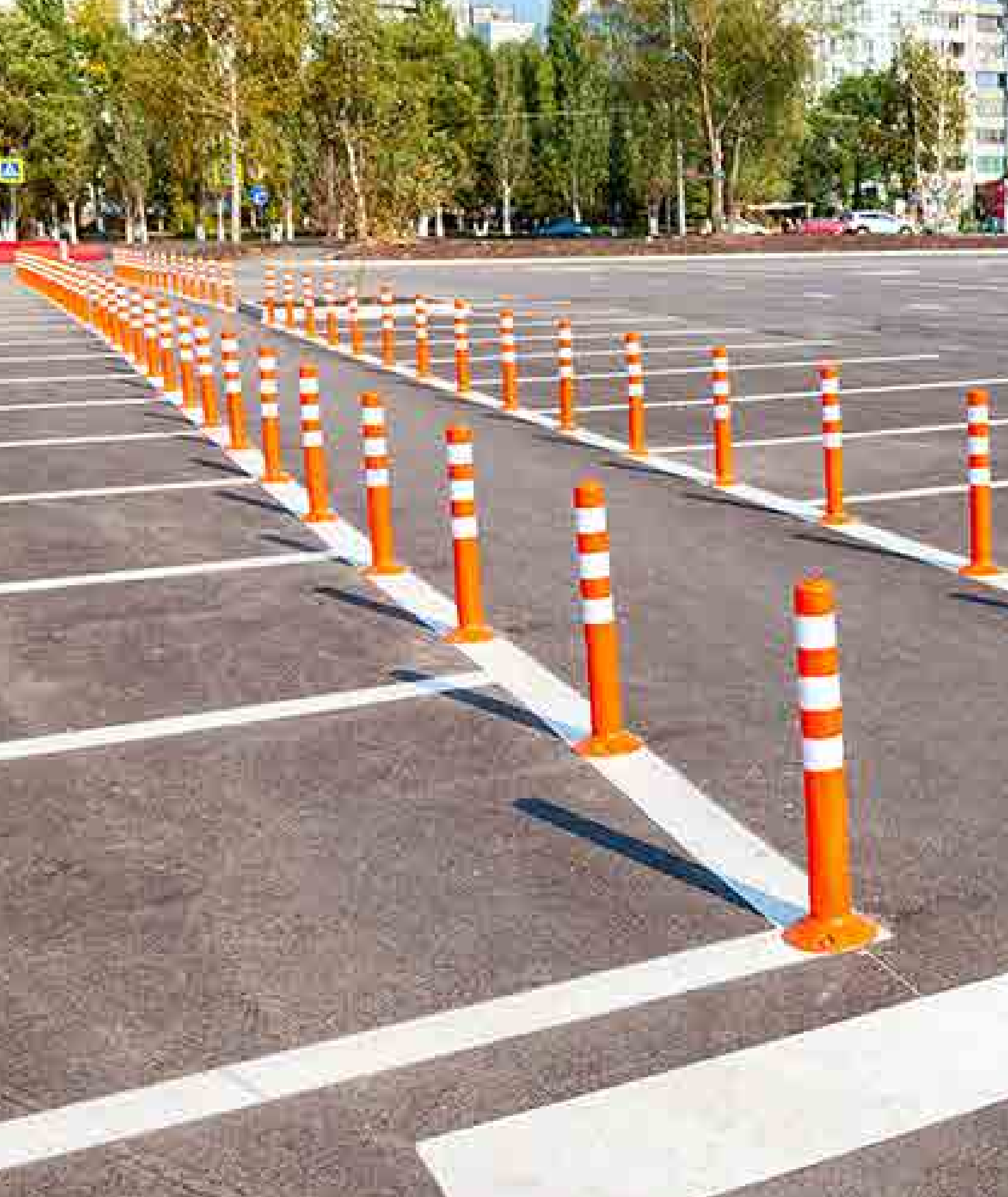
Traffic Bollards & Post