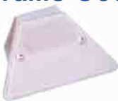
Steel support Single side