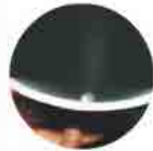
Slice PVC Delineators

Height: 935 mm Width: 100mm Thickness: 4mm Weight: 0.7kg