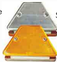
Trapezoid Guardrail Reflectors

Size: L120xW50xH70mm Double sides with double supports