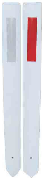
Slice PVC Delineators

Height: 935 mm Width: 100mm Thickness: 4mm Weight: 0.7kg